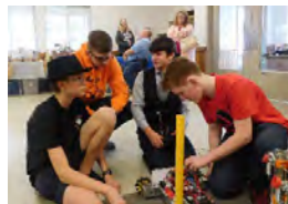
Students teach each other (and Lions) about their robots.