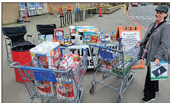
Our unnamed “Super Donor.”

Throughout the day, shoppers coming to the Walmart’s took the shopping lists and brought out lots of non-perishable food, personal hygiene items, feminine hygiene items and a most wanted subject, toilet paper! Along with their beer, pizza, chicken wings, etc. for their Super Bowl parties, they also stuffed the Lions donation jars with cash. One “Super Donor” brought out 2 full shopping carts, saying she’d been gifted and lucky all her life and that it was the least she could do! Please see the photo and her big smile!