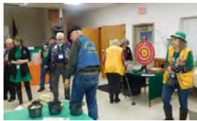
Lions enjoy the Casino Night sponsored by the foundation