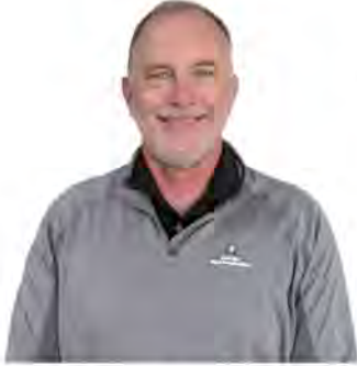
Submitted by Brad King