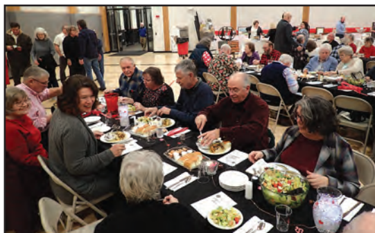
Some of the 139 patrons served in the Freres Family Gymnasium