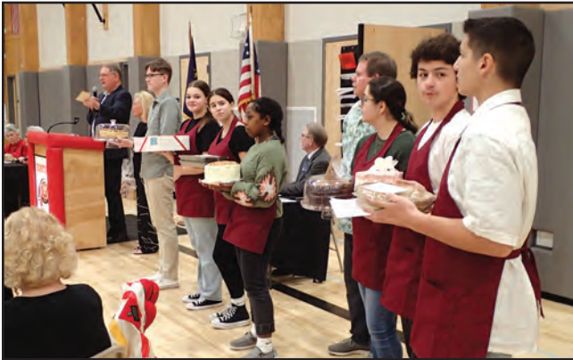
Santiam Jr/Sr High School students are queued up with auction items.