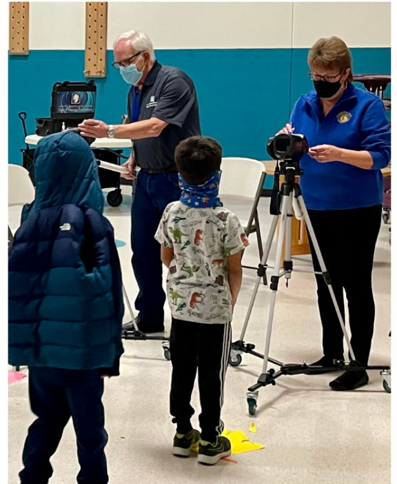
Students being screened at Hugh Hartman Elementary, November 29th, 2021.