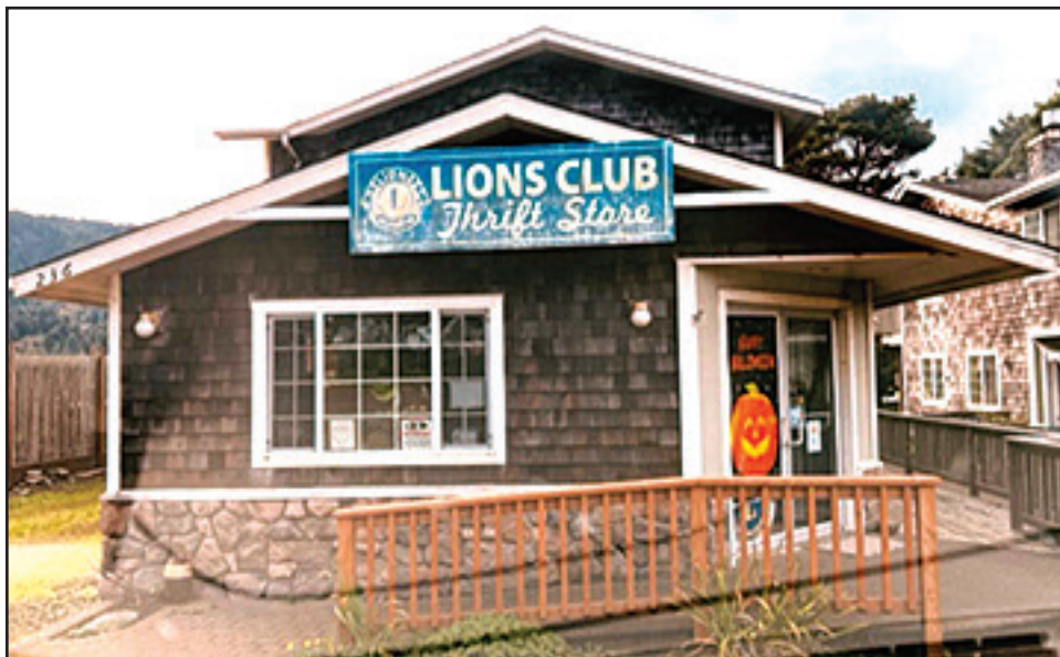
The Yachats Thrift Store.

When you visit Yachats don't forget to visit their thrift store and maybe make plans for their annual crab feed in January.