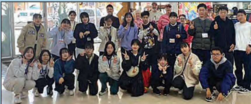
Group photo after lunch.