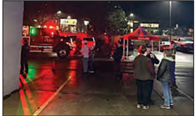
The crowd outside.