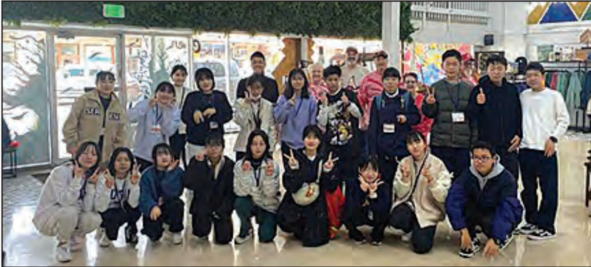
(l-r) Group photo after lunch.