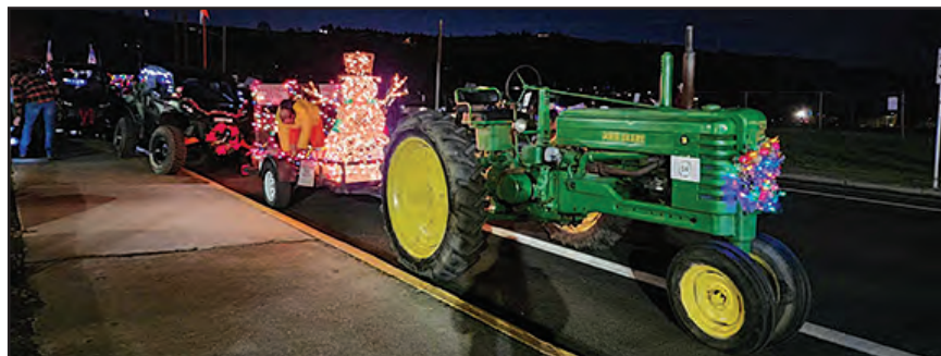
Our float in the Starlight Parade.

Our entry in the parade advertises our annual Christmas Tree Pickup which is held in January.