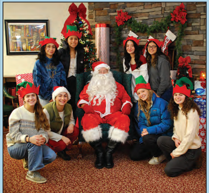
Santa with the Leo/Elves.