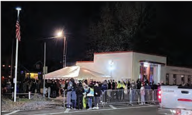
Crowd enjoying the event.