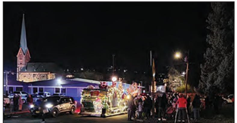
Crowd at Tree Lighting. Santa had just arrived.

Remarkably, The Dalles Lions Club has faithfully provided this invaluable service for many years, and their commitment to safety has resulted in an impeccable record—no injuries to date.