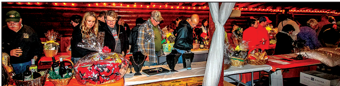
Attendees reviewing auction items