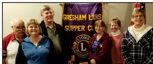
Gresham Supper Club members