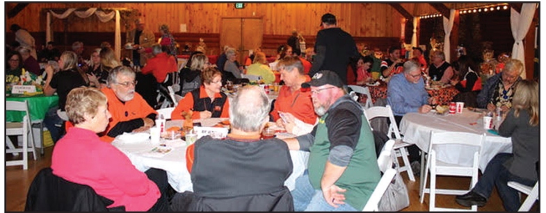
Attendees enjoying dinner

Once again, the Gresham Breakfast Lions Club and the Damascus-Boring Kiwanis Club joined forces to organize their annual Civil War Tailgate BBQ and Auction . The event was held on November 9, 2017, at Club Paesano in Gresham. The fundraiser has been a combined effort by the Lions and Kiwanis for the last twelve years. All work and proceeds are shared equally and both Clubs feel that as often happens, their combined efforts are definitely greater than what they could do individually. This year's event was one of the best ever! Once again, pitting the "Ducks" against the "Beavers". The eventual winner of the football game is secondary to the many families and individuals who "win" as a result of the numerous projects that are funded by this annual event, such as: