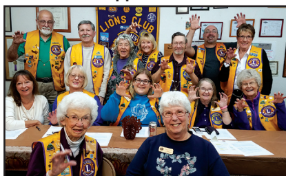
Lions in the Cloverdale-Nestucca Club roar at a meeting