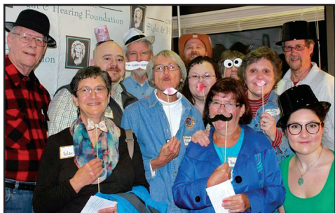
Some of the Milwaukie Lions at a Foundation event