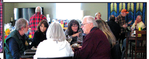
Lions and guests having fun