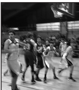
Pictured are teams from Huntington and Baker City squaring off during the invitational