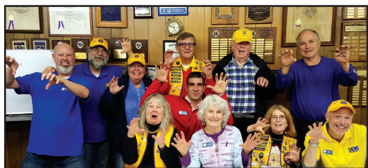
A roar by the Knight Lions Branch Club