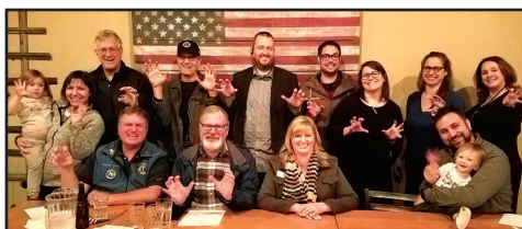
Oregon City Lions Club give a Roar at a club meeting