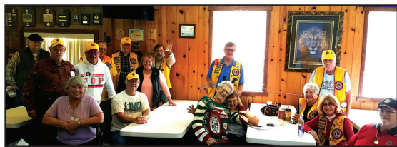
Rockaway Lions at a meeting in their clubhouse

In my District Governor club visits in November, here is some of the wonderful service I heard about from the following clubs.