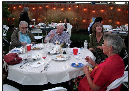
Enjoying the great food and fellowship.