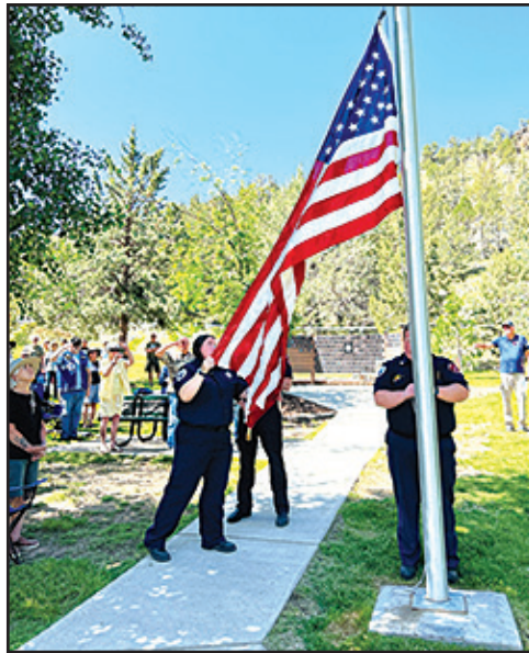
Posting of the Colors by CRR Fire & Rescue.