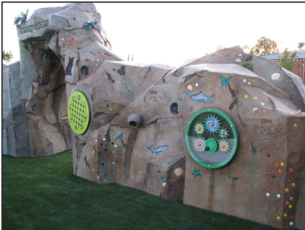
A look at the Arc Park Sensory Wall.