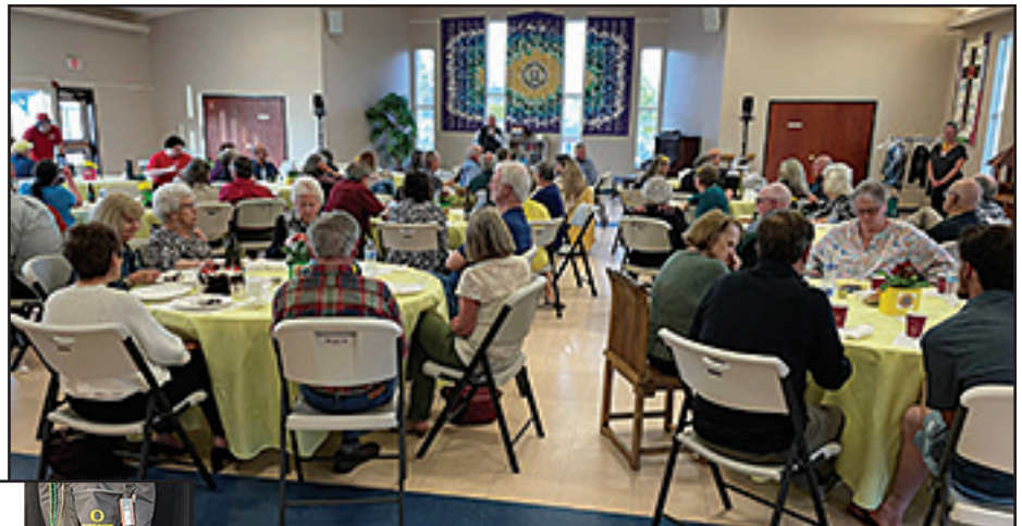
Looks like a full house for the Spaghetti Dinner.