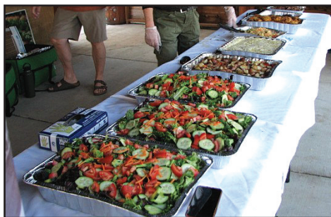
Look at the great food.

Of course, as usual, the food was excellent and the special cake with the Club's new Centennial logo on it was wonderful.