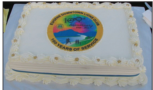
Our new Club Centennial Logo on the celebration cake.