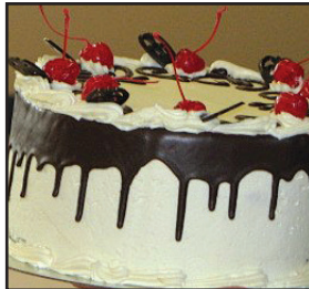
Just look at that wonderful dessert cake.

During the dinner, we enthusiastically promoted our Silent Online Auction, aptly named "Here Comes the Sun," which commenced on Monday, April 24th, and ran until Saturday, April 29th. There were many items up for bids that were put together as packages. While the number of online bidders fell short of expectations this time, their participation still helped us raise an impressive $4,893.00. The profits from the online auction, live auction, and dessert auction will be allocated to the Club's Activity Fund, while the proceeds from the Spaghetti Dinner ticket sales will contribute to the Club's Administrative Fund.