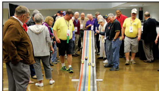
Pinewood Derby Race and the winner is ....