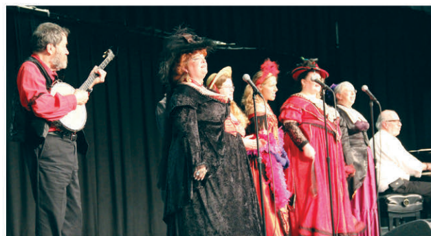
Astor Street Opry Company