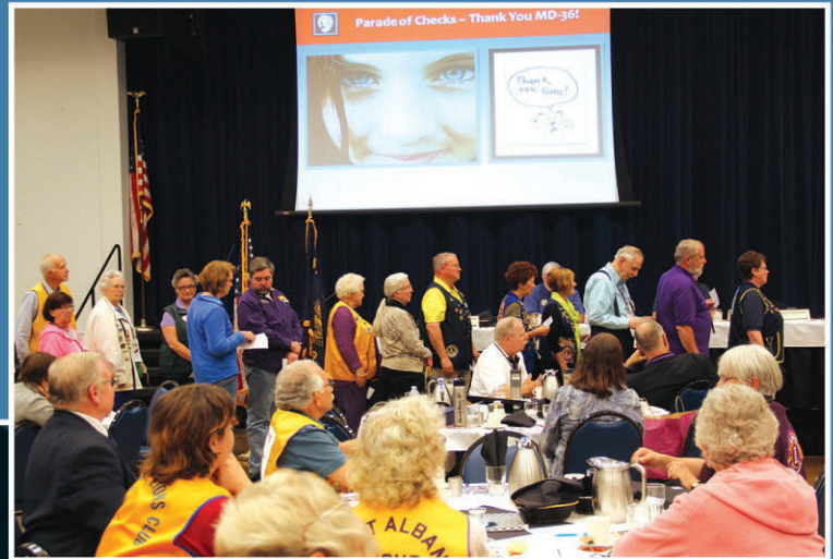
OLSHF Parade of Checks