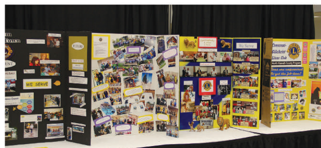
Club Story Boards