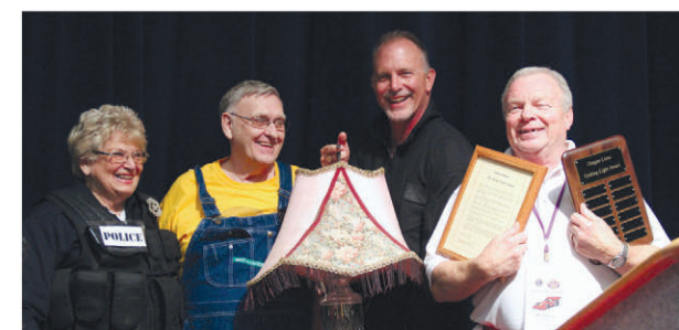
New traveling MD36 Award "The Guiding Lamp"