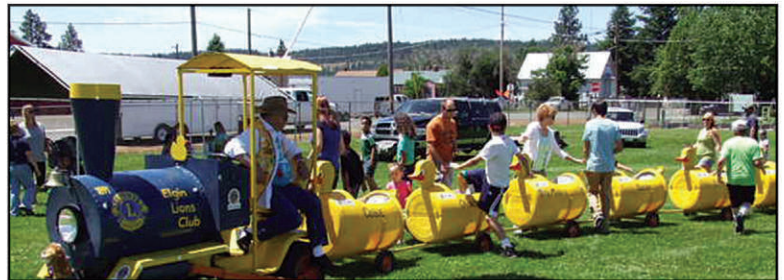
Elgin Lions Duck Train

Train was available, unless one had a warrant out for an arrest in which case the Lion