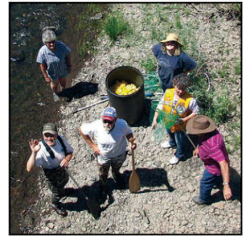
Lions retrieve lots of ducks

Saturday morning featured the firemen's breakfast with a menu of all-you-can-eat pancakes and sausages. Meanwhile, it was reported that over