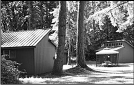
Some of the cabins at Camp Taloali

Summer fun for children usually includes having a great camping experience, even deaf or hard of hearing children. Camp Taloali has provided a great camp experience for 42 years. Located east of Salem on the banks of the North Santiam River, this camp will provide four weeks in July and August of outdoor learning for deaf and hard of hearing children aged 6-18.