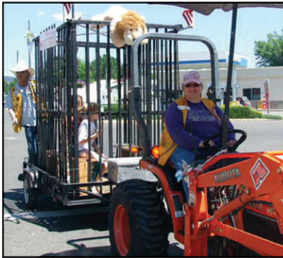
Mobil jailhouse traveled around town

30 yard sales were taking place with a map outlining the addresses created and distributed by the Lions. For individuals that wanted to move about the city, the Lions Duck