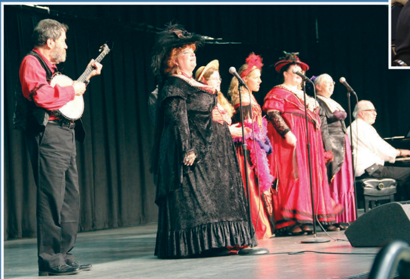
Entertainment by the Cast of Astor Street Opry Company