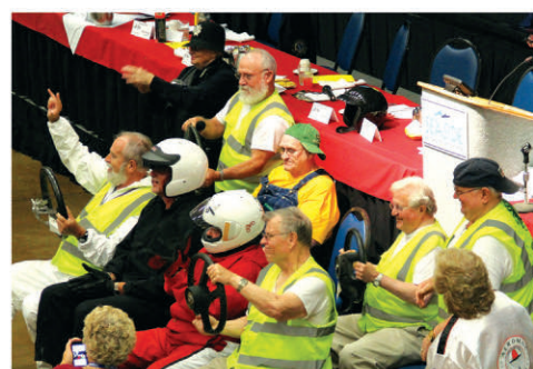
Race car drivers and "Pit Crew"

Thursday, the OLSHF along with the Council of Governors held their final meetings of the year. The meetings were followed by a fun Sparkplug Derby Race and a bonfire and S'mores on the beach. It was a great time to chat and share stories with fellow Lions.