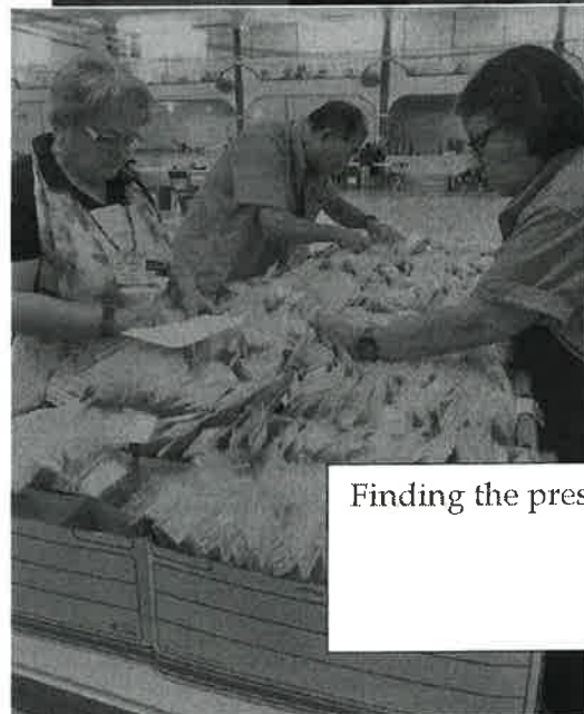
Finding the prescriptions!