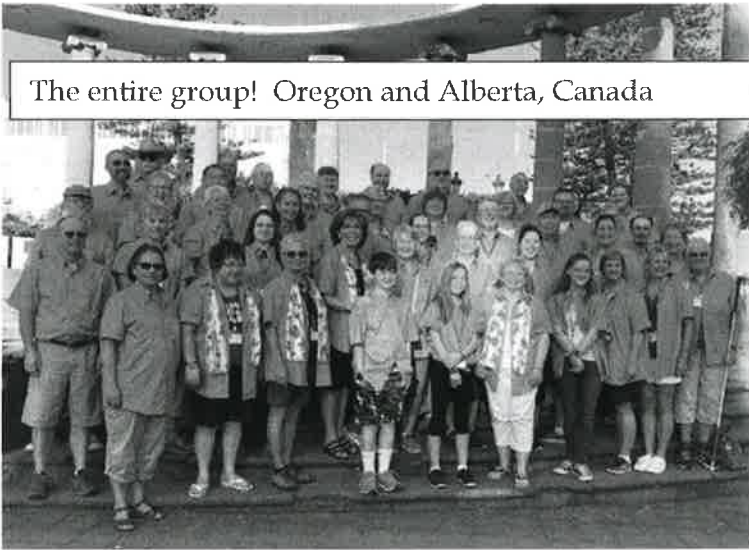
The entire group! Oregon and Alberta, Canada