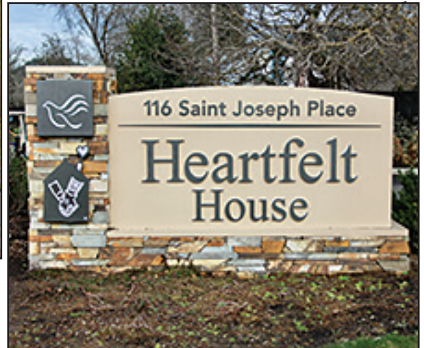
The Heartfelt House.