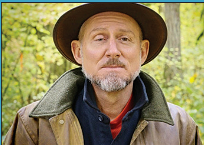
See Story Page 8