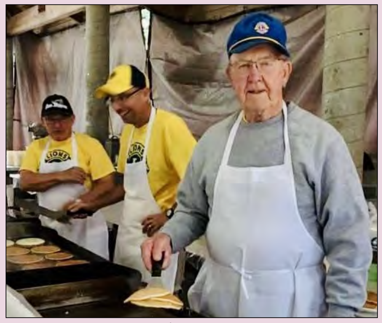
Albany Lions Lumberjack Pancake Breakfast.

At our State Convention, we would like to celebrate our Multiple District with a slideshow featuring all clubs in MD-36. We need your help to make this happen.