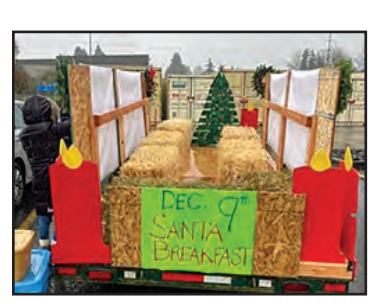
Sign advertising EDT Lions Pancake Breakfast with Santa & Mrs Claus.