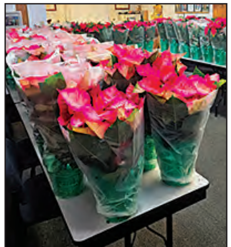
Our Lions Poinsettia sale.