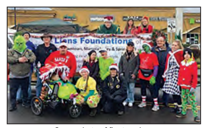
Group photo of float workers.