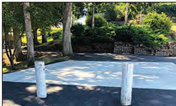
The new ADA parking spaces.

The park was not handicapped friendly, so the Club this year took on making the park handicap accessible. The park now has two handicap parking spaces for vans, special seating for eight wheelchairs right next to the handicap accessible restrooms and new concrete and blacktop paths. The club also added a concrete stairway from the parking lot into the park that includes lighted stairs steps. More information to follow on the Families in the Park concerts held all through August.