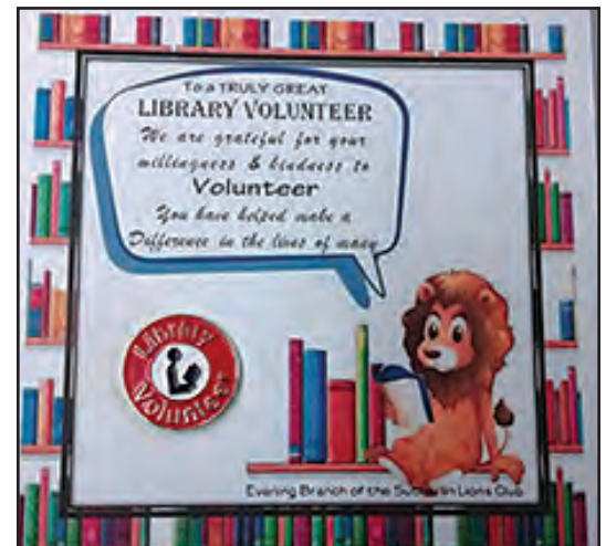
Library Volunteer pin/card.