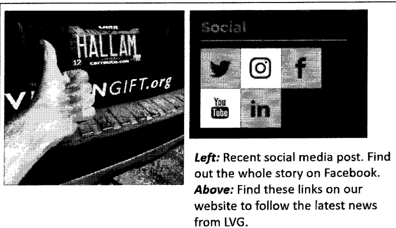
Left: Recent social media post. Find out the whole story on Facebook. Above: Find these links on our website to follow the latest news from LVG.

website. Follow us on Facebook and Instagram. We try to keep our social media current and if you follow us and share our stories, it connects our mission to many more people than yourself. It is VERY hard to stay relevant in today's fast paced 24-hour news cycle. When you follow us on social media and share our news, you are championing our mission of honoring donors and their precious gifts of sight. It's