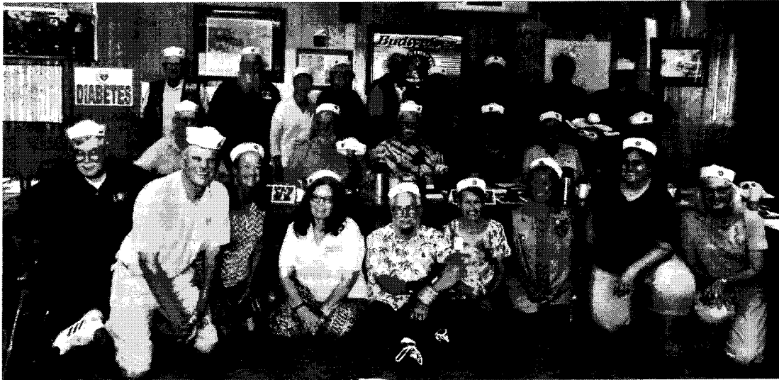
District G Cabinet meeting

District G is off and running for its new Lions year of service. Our first District Cabinet Meeting was held last Saturday in Rufus I was extremely pleased with the turnout, especially considering how far many had to drive to attend. Twenty-four dedicated Lions gave up a beautiful Saturday so we could "Get the Party Started" in District G.